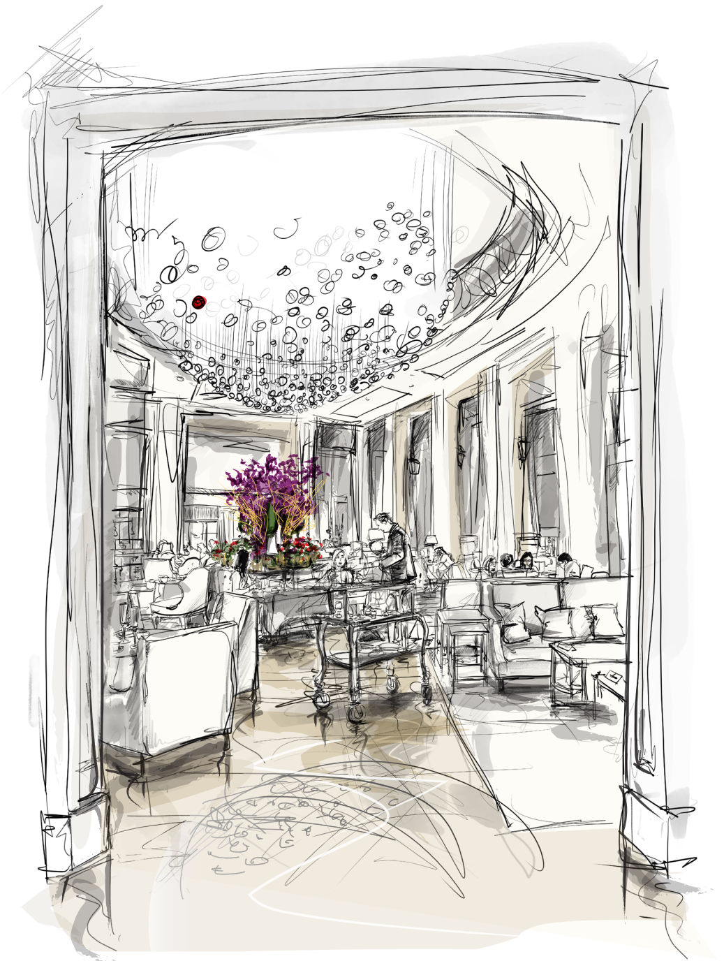
AFTERNOON TEA AT THE CRYSTAL MOON LOUNGE