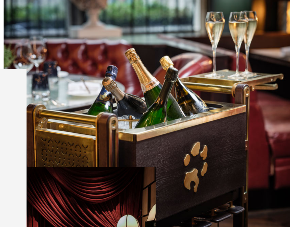
KERRIDGE'S BAR & GRILL