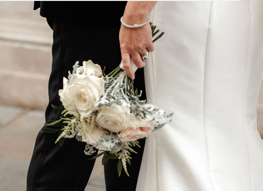
CHLOE CALDWELL PHOTOGRAPHY

Whatever your preferences, our dedicated team of experts will work closely with you to curate a bespoke experience that reflects your personal style and vision.