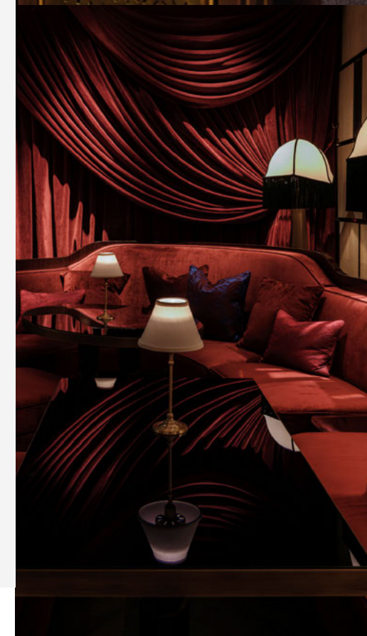
VELVET BY SALVATORE CALABRESE