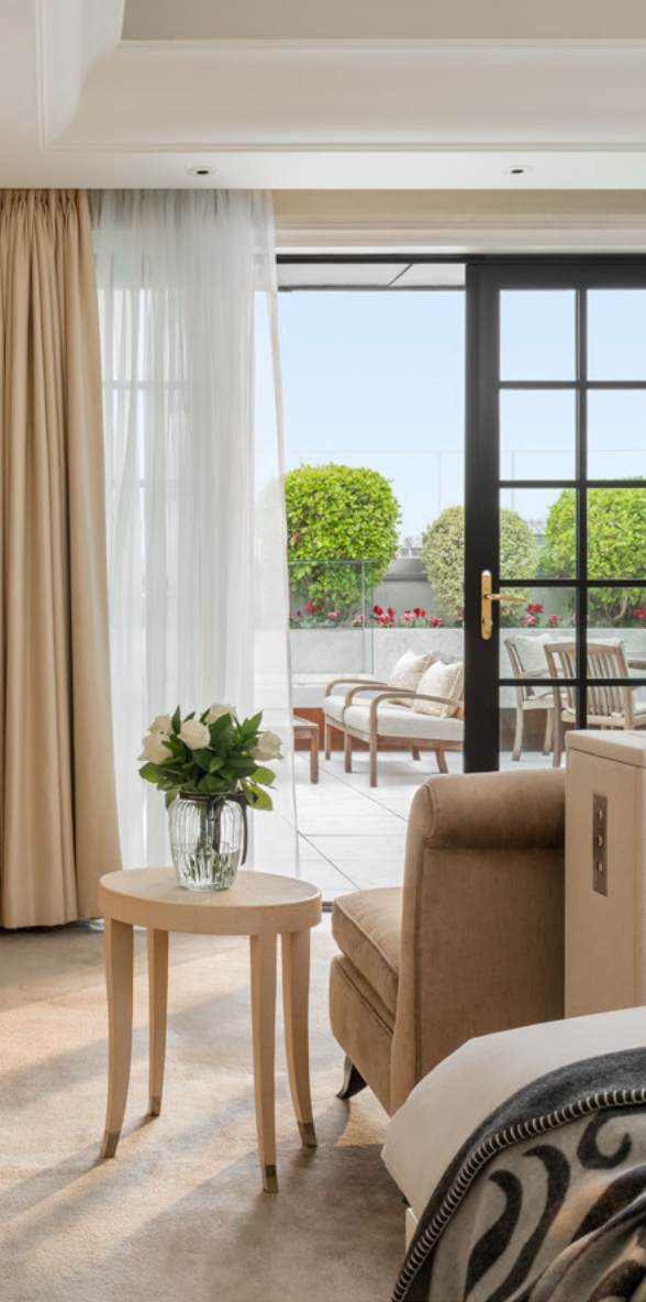
THE HAMILTON PENTHOUSE